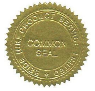
Certification Manager Date: Jan. 13, 2016 Date: Jan. 13, 2016

This certificate applies specifically to the sample investigated in our test reference number only. The CE markings as shown below can be affixed on the product after preparation of necessary technical documentation. Other relevant Directives have to be observed.